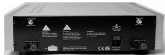
2-ch THX Ultra2 Amplifier 200 watts/ch. 8 ohms<0.03% THD (20Hz-20kHz - both channels driven)