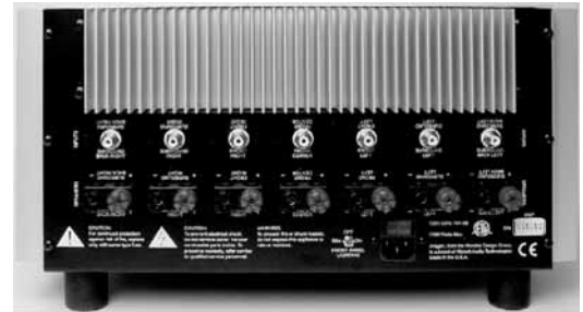
7-ch THX Ultra2 Amplifier 200 watts/ch. 8 ohms<0.03% THD (20Hz-20kHz - 3 channels driven)