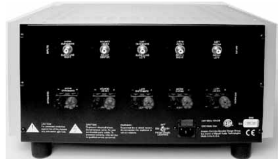
5-ch THX Ultra2 Amplifier 200 watts/ch. 8 ohms<0.03% THD (20Hz-20kHz - 3 channels driven)